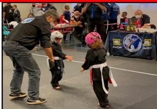
4 years old kids in Rumble (World Games 2022 Salzburg)